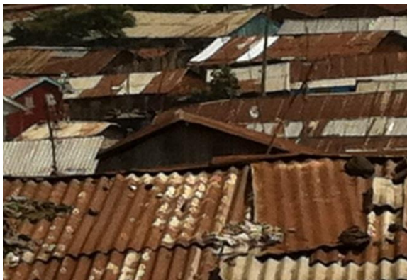
View of Kibera from Laini Saba School